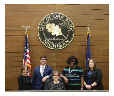
City Council, City of Oak Park

THE CITY OF OAK PARK operates under a council-manager form of government. Council, as the legislative body, is comprised of five members – the mayor, mayor pro tem, and three members. City Council is