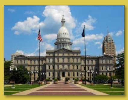
State Capitol in Lansing